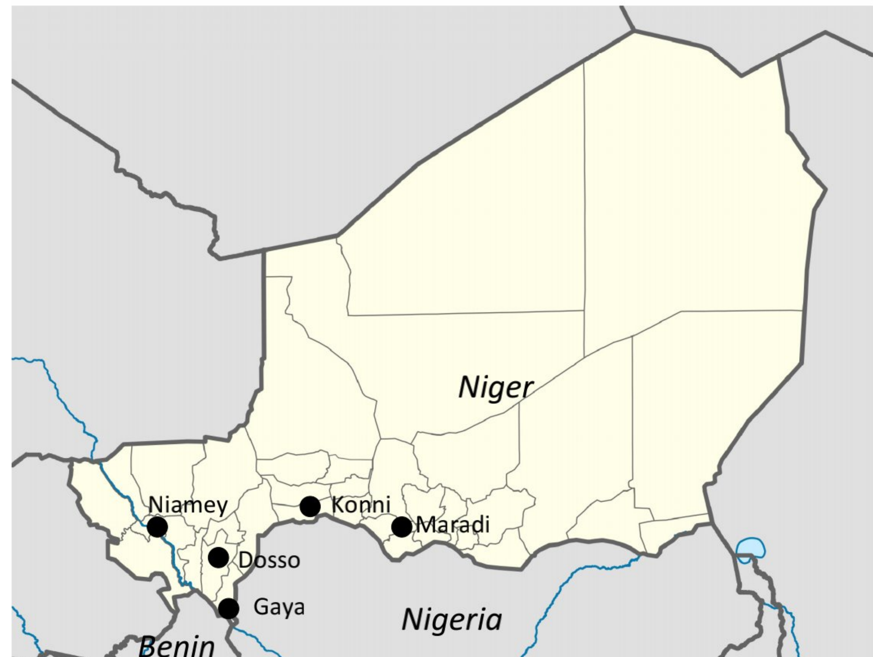
Figure 3. Locations in this study.