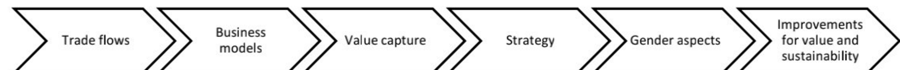
Figure 2. Overview of this study.

The outline of the research is shown in Figure 2.